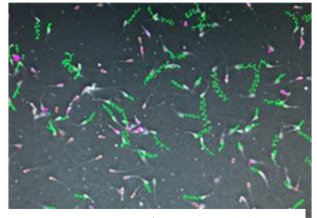
Figure 3. Assessment of motion and kinematic characteristics of semen using computer-assisted semen analysis (CASA).

The sperm concentration of the Anatolian buffalo, another parameter obtained in the study, was